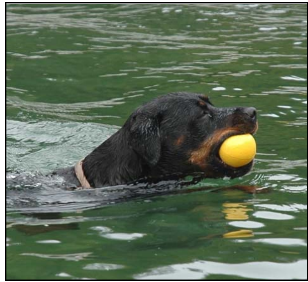
Swimming is one of the many dog sign offs

mission is to master the skills. We take classes at each monthly training, and continue to look for classes in the private sector that we think might be useful. Remember that knowledge is power, and the more complete your skill sets, the better off you will be.