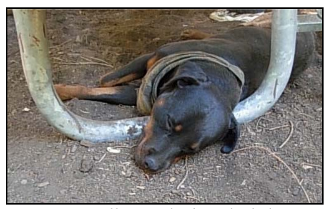
You are tired because you have been pushing hard,

Now you are getting close to achieving your goal. Your logbook is full of trainings, your dog is advancing and, the end is in sight. You are more than likely tired because you have been pushing hard and your brain is in over load. The good news is that your handler skills and dog sign offs are complete and you have knocked out your six monthly trainings. Your team and sponsors are happy and you are maturing into the kind of first responder that I would want looking for my loved one. Your next step is to turn in all of your paperwork to the board for approval and verification and to get that almighty pager.