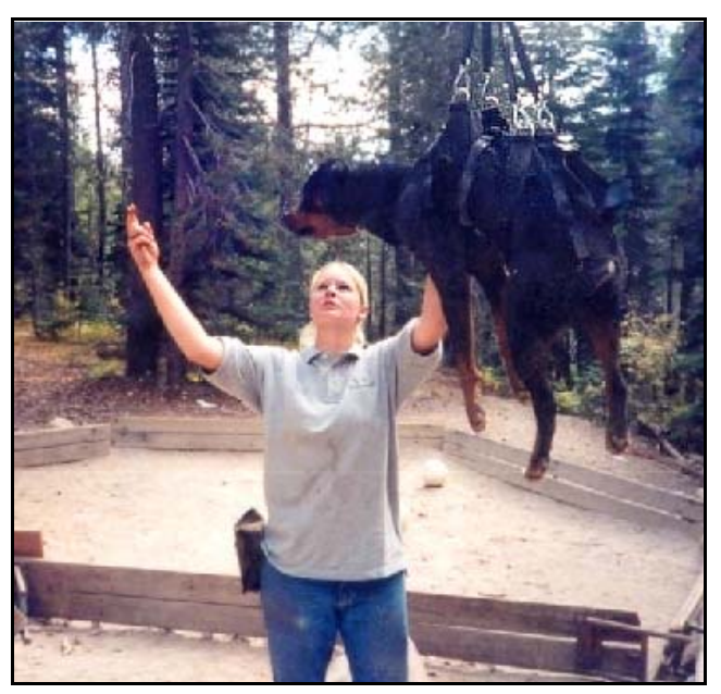
You will learn about ropes and low angle skills

This level of class is not sufficient to qualify the handler for low angle rescue teams. In this class you will learn about personal safety, team safety, anchor systems, belay skills, and raising/lowering techniques.