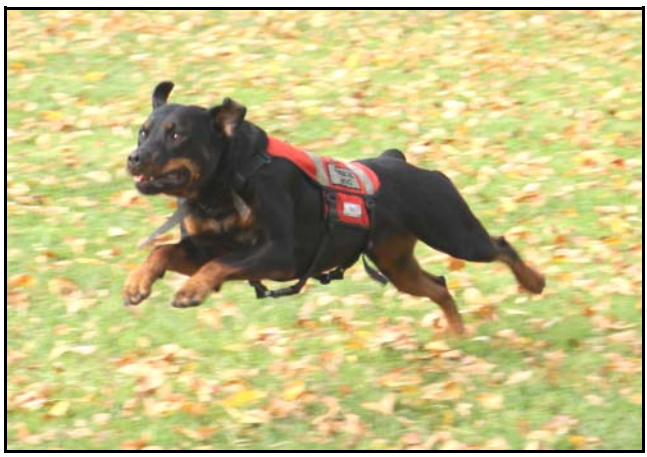
But you're going to get the mission done!

You are feeling like your ready to search; but, there is still more to do. You will need to complete observation hours and do your testing. You are close "Grasshopper", not much further now, but you still have the final showdown. You will need to prove that you have what it takes and that you and your dog as a team can get the job done to a standard acceptable to the organization of which you are a member. "Here we go, here we go!"