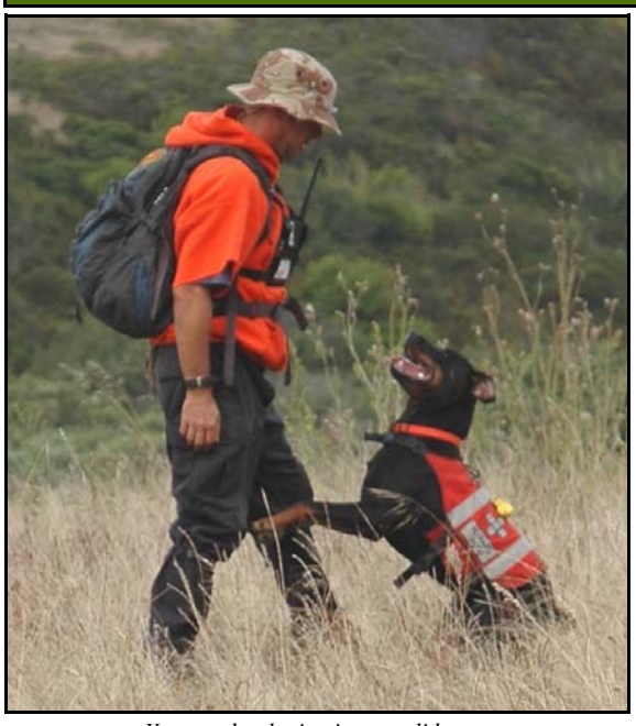
You are developing into a solid team

You have a goal. You and your dog are training hard to become a certified SAR team. When you first began, this goal seemed almost unattainable; but, now as you look back, you realize just how far you have come. Things are making a bit more sense; but, there is still uncertainty and much more to get done so you and your dog can get out there and help make a difference in a stranger's life.