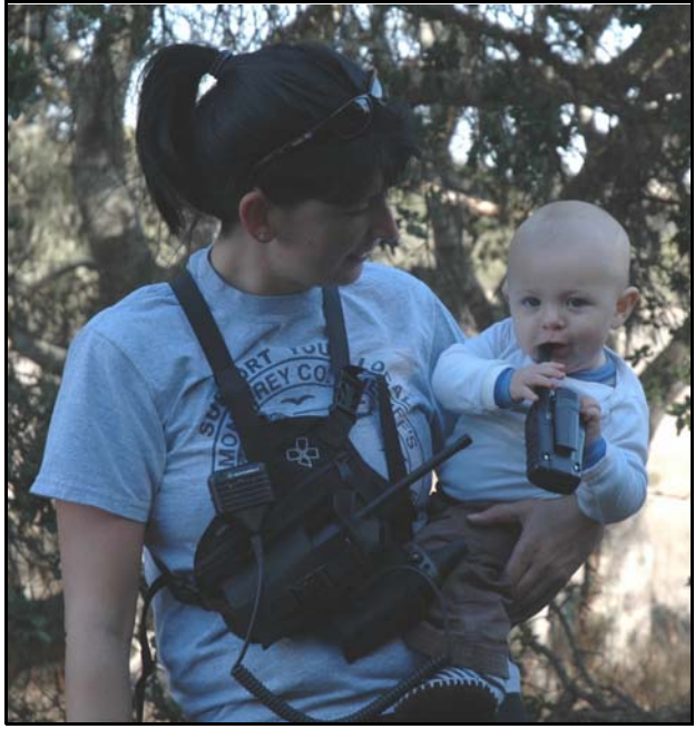
The radio is your life line to Search Base

Knowing how to use your radio is important. Not only do you need to understand the mechanics of it, but you will learn legal requirements and handler responsibilities as defined by the FCC for specific frequencies and protocols. There is much more than just turning it on. It is critical that you are able to communicate comfortably and that you can convey information clearly over the radio. Sounds simple, but then again "don't always judge a book by its cover." The radio is your lifeline to search base.