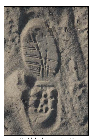
Could this be our subject?

This class teaches you the basics of following human track, just like the Indian scouts in the old western movies. I thought this was very cool; but, then I had to struggle to acquire a rudimentary skill set. This is another class that I will be taking repeatedly. Some SAR units exclusively do man tracking, and their work is amazing. In man tracking, you will learn how to describe and document tracks, how to use a tracking stick, label tracks, understand lighting and techniques for dealing with poor conditions (i.e. high sun angle, cloudy days). You will also learn all about sign and sign cutting jump tracking, step-by-step tracking, track traps and the preservation or protection of sign. Man tracking is often difficult work, but, having a good grasp of this skill can be a tremendous help in the field. Many times, you will find subtle clues that will tell you that you are in the right area. It is not uncommon for a