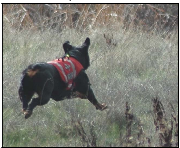
Inca says it is, you will learn to trust your dog

This is a very important and interesting class. You will be working with local law enforcement, so you better learn how to do it right. Often,