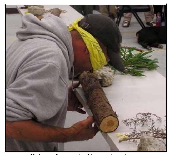
Understanding scent is a big part of your journey

mission is to master the skills. We take classes at each monthly training, and continue to look for classes in the private sector that we think might be useful. Remember that knowledge is power, and the more complete your skill sets, the better off you will be.