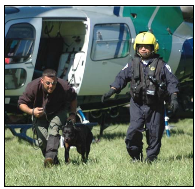
You will spend lots of time around helicopters

what might begin as a lost person case, will end up being a case of foul play, and so understanding how to work in and around a crime scene becomes vital. You will learn about the chain of evidence, protecting the crime scene, and proper documentation of the crime scene.